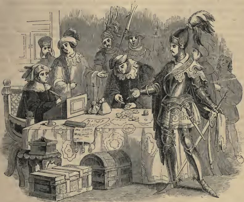
LORD BEAUMANOIR PAYING THE RANSOM OF THE CONSTABLE DE CLISSON. Designed from Harl. MS. 3469 and a MS. Froissart of the 15th century.

to be done ; for we know that all the armaments at Treguier are countermanded, which is a sure sign that nothing will be attempted this season, and with reason ; for the constable will be solely occupied to revenge himself for the insult the duke of Brittany has put upon him." These three lords, having dismissed all the men at arms and cross-bows that were in and about Harfleur, took the road for Paris, where the king resided. The lord de Beaumanoir was so active, that, within four days, he put the duke's officers in the possession of the three castles and the town of Jugon, to the satisfaction of the duke. He afterwards collected the amount of the ransom, and paid it according to the duke's pleasure. When this was all done, the lord de Laval said to the duke,—“ My lord, you have now received the whole of your demands : the three castles and Jugon. and one hundred thousand francs, deliver up to me, therefore, my brother-in-law, the constable.” “ Willingly,” replied the duke : “ let him depart : I give him his liberty.” The constable was then given up, and instantly set out, with the lord de Laval, from the castle of Ermine*.